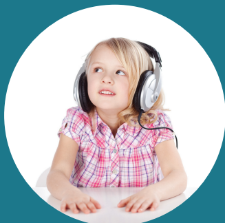
FULL HEARING ASSESSMENT